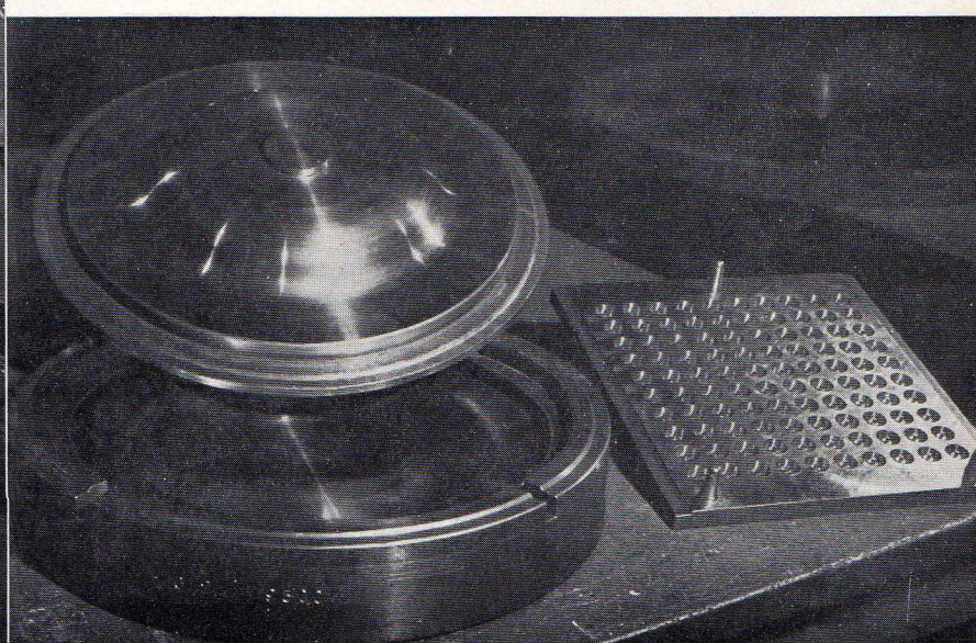
Typical jobs—Left: Pump Diaphragm, single-cavity. Right: Seat Buffers 100 cavity.