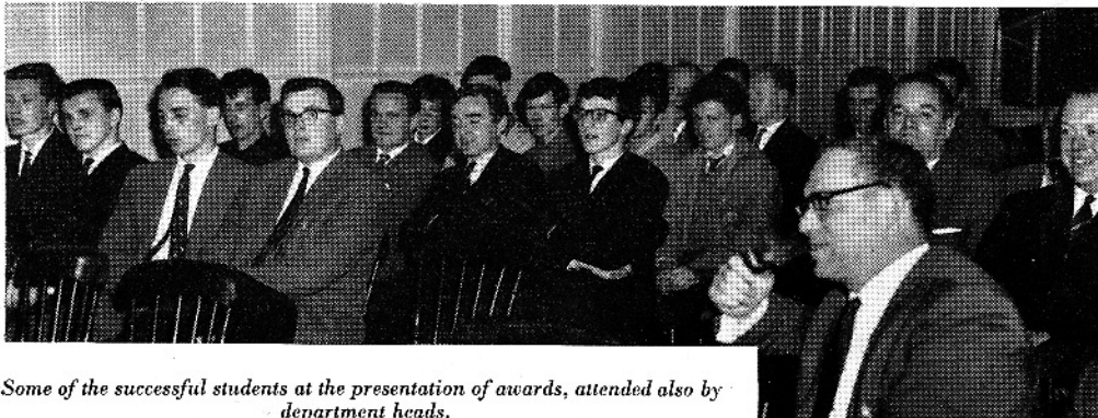
Some of the successful students at the presentation of awards, attended also by department heads.